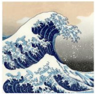
Preparing for a Cascadia Subduction Zone Tsunami: A Land Use Guide for Oregon Coastal Communities

The Oregon DLCD Coastal Management Program has released a new land use guide for coastal communities, Preparing for a Cascadia Subduction Zone Tsunami: A Land Use Guide for Oregon Coastal Communities .